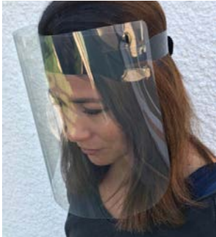
Recommended for single, daily use.

Face visors add an additional layer of face protection. A plastic shield protects the nose, mouth and eyes from airbourne germs emitted from coughing and sneezing.