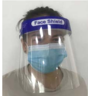
Recommended for single, daily use.